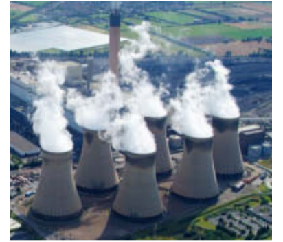
Controversial: The Drax plant