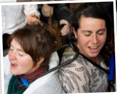
Off target: Protesters in white boiler suits chanting outside the wrong building yesterday as some (left) resorted to bike locks

tried to tell some that Drax had moved out but they said something about undercover police trying to persuade them to move on so they wouldn't believe me. We would have thought they would be quite happy with our energy.